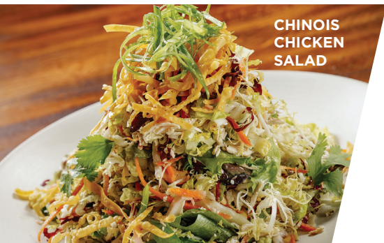
CHINOIS CHICKEN SALAD

cherry tomatoes, cucumbers, olives, red onions, pepperocini, feta, lemon vinaigrette