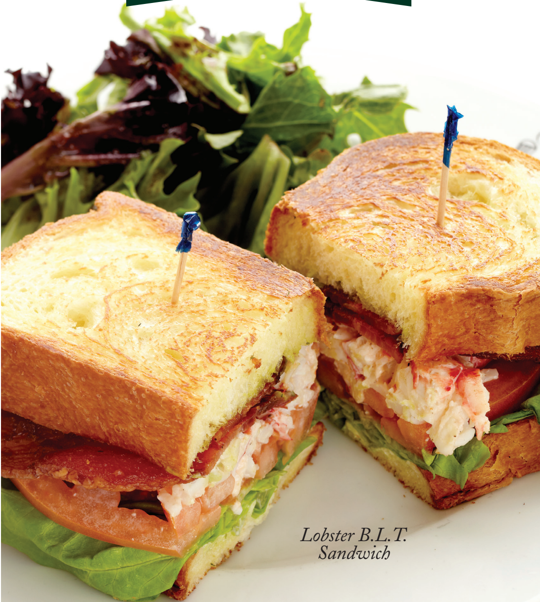
Lobster B.L.T. Sandwich

Shop our extensive collection of Stonewall Kitchen Gourmet Specialty Foods.